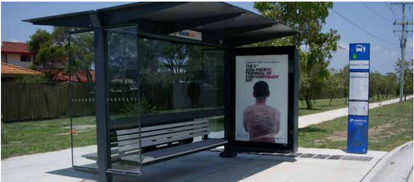
Example of the type of bus stops proposed throughout Caloundra.

Express bus services travelling between Caloundra and Maroochydore will use Nicklin Way. Generally, only all-stops services will use the Moreton Parade to Buderim Street route.