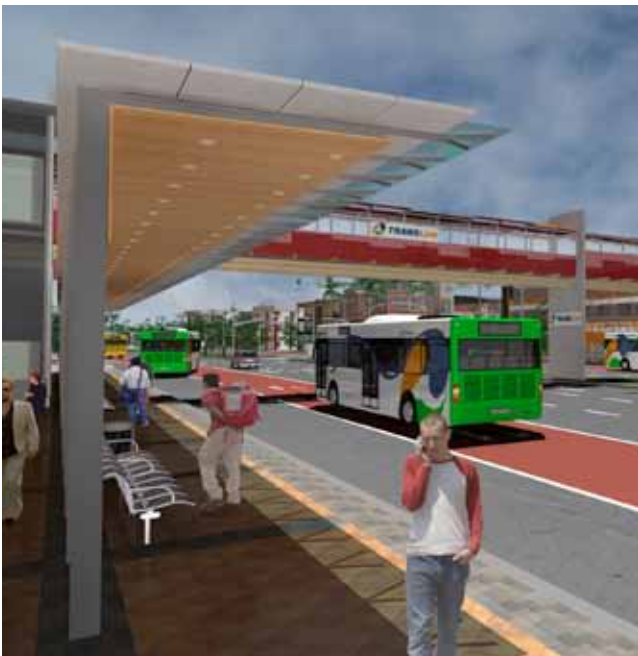
Proposed bus station on Nicklin Way connecting to Kawana Shoppingworld.

These lane conversions will only occur after the number of general traffic lanes across the Mooloolah River has increased. This is being planned as part of the Multi-Modal Transport Corridor Study.