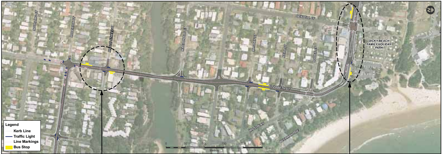
Section 2 - 1