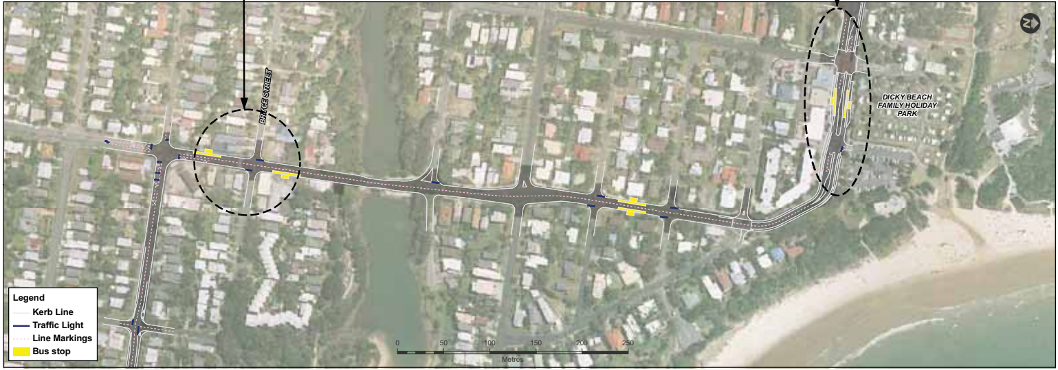
Concept design (September/October 2008)