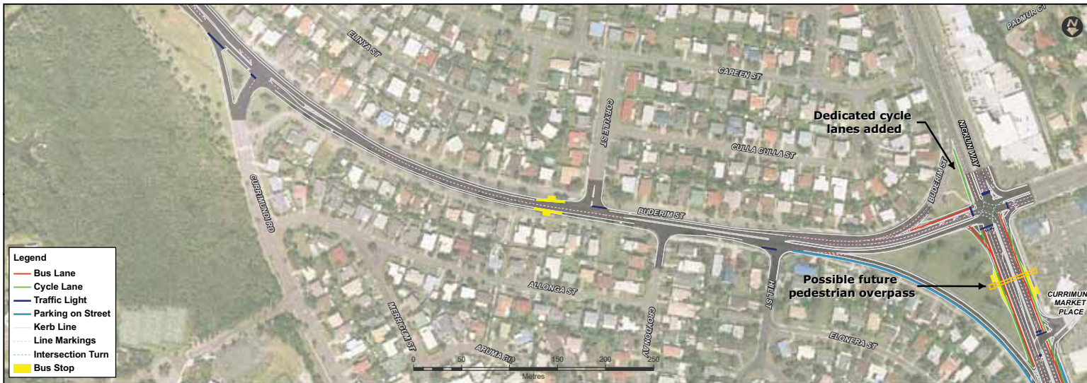
Section 2 -3