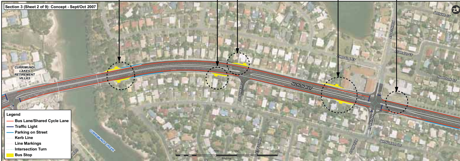
Concept design (September/October 2008)