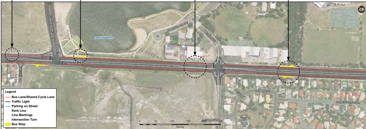
Concept design (September/October 2008)