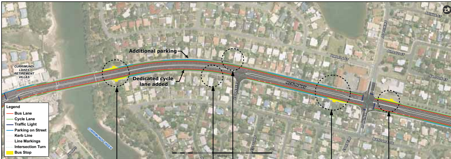
Revised concept design