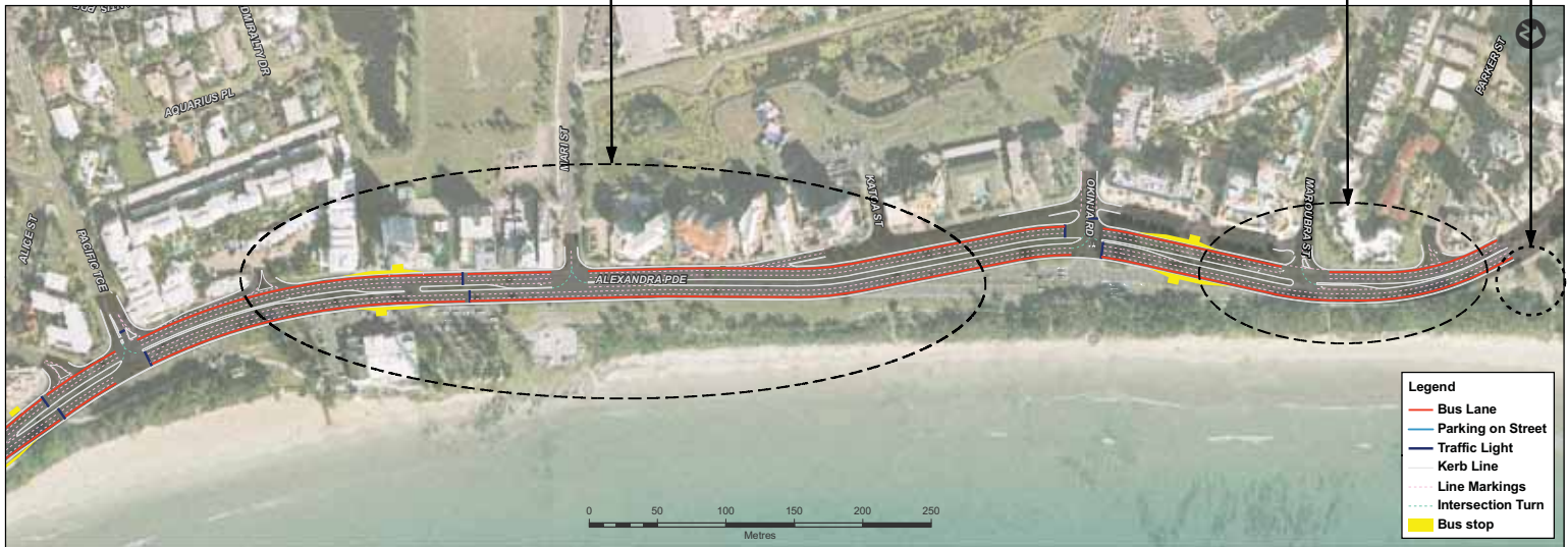
Concept design (September/October 2008)